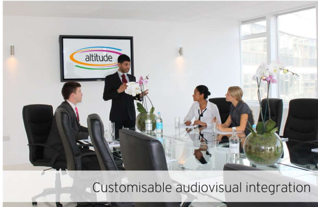
Customisable audiovisual integration