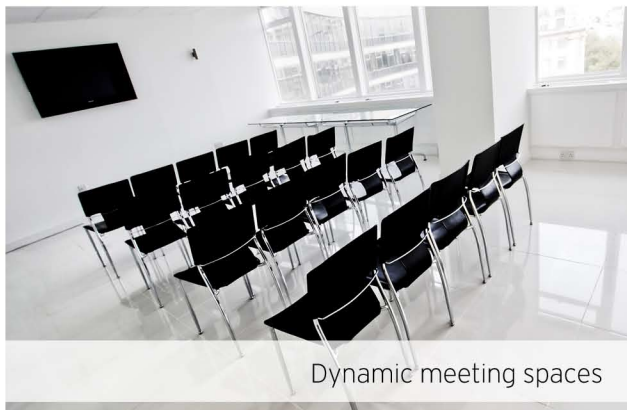
Dynamic meeting spaces